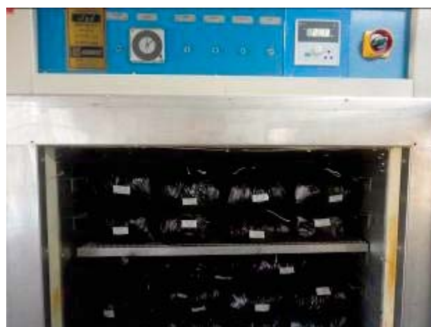
Fig. 1. The storage of scales at polyethylene bags containing cocopeat and perlite (1:1) in 25 °C to induce and produce scale bullets.

Oriental hybrid lily “Arabian Red” bulbs (18-20 cm in circumference, Van den Bos, Netherlands) were scaled. Middle scales on basal plate with same weight (2-2.5 g) were used in this experiment. Scales were dipped for 15 min in a fungicide solution containing 1% (w/v) Benomyl. After air drying, 10 scales were planted in polyethylene bags with some punctures containing \approx 1 liter of moist cocopeat and perlite (1:1, v:v; 85-90% moist). The bags were placed at 25 °C in the growth chamber for 3 or 5 months (Marinangeli and Curvetto, 1997; Fig. 1). After storage duration (3 or 5 months) were recorded number of scale bulblets per scale, number of main roots, lengths of main root (cm), diameter of scale bulblet (mm, Digital caliper, Japan, accuracy: \pm 0.02) and number of scales per scale bulblet. The soluble carbohydrates in the vernalized scale bulblets (2 months at 3-5 °C) were analyzed with following method.