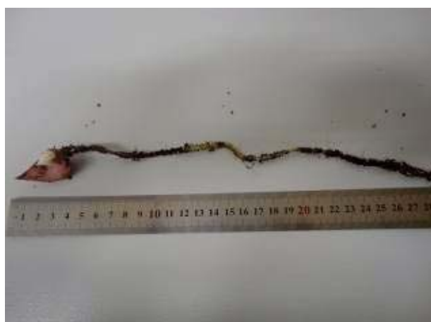
Fig. 4. The growth of root during scale propagation in Oriental lily "Arabian Red" at cocopeat: prlite (1:1) substrate in 25\text{ }^{\circ}\text{C} .