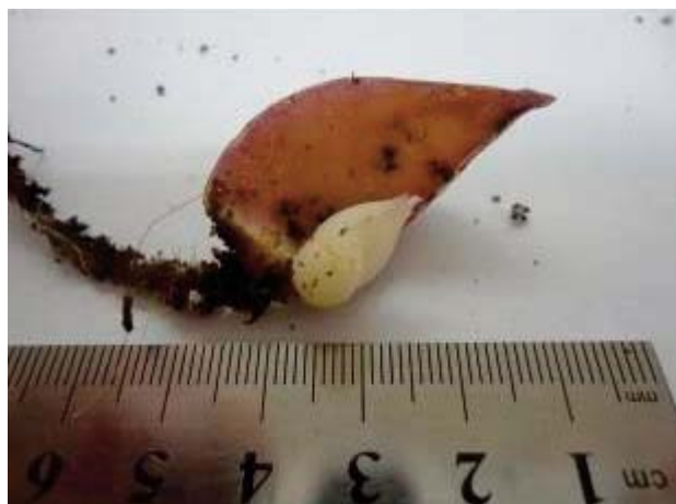
Fig. 3. Scale bulblet at mother scale base of Oriental lily "Arabian Red" after 4 months in 25\text{ }^{\circ}\text{C} .

The increasing duration of storage to 5 months was increased diameter of scale bulblet 4.407% compared to 3 months. The size of bulblet affects the quick and uniform sprout and produce efficiently photosynthesis leaves and bulb enlarge rapidly (Langens-Gerrits et al. , 2003). After scaling, and production of scale bulblets, three different types of plants grow from scale bulblets (Matsuo, 1972; Matsuo and Van Tuyl, 1984; Matsuo et al. , 1989). The scale bulblets that grow in the development of ETP (Epigeous type plant), enlarge rapidly to produce yearling bulblet and forcing sized bulb. These plants produce one foliated stem, other plant is hypogeous type plant (HTP) that has only scaly leaves, and other plants are hypo-epigeous type plants (HETP) that have stem and scaly leaves. Matsuo and Van Tuyl (1984) demonstrated that bulb storage temperature and duration affect on scale bulblet development and type of plant development. Han et al. (2005) reported the normal bulblets formed shoots with one foliated stem, and they grown normally in greenhouse, after cold treatment at 5\text{ }^{\circ}\text{C} for 2 months. Most of the bulblets produced stems with several leaves. These bulblets grow rapidly in soil and they increase the frequency of large commercial bulbs in a short time. Fast growth occurred in large bulblets and in bulblets that formed a